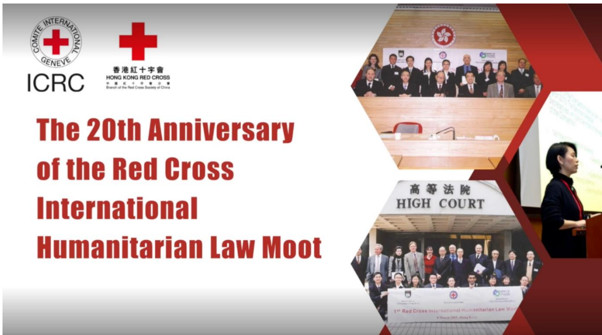
Photo 4: The Anniversary Video has been uploaded to celebrate the 20th anniversary of the Red Cross International Humanitarian Law Moot in the Asia-Pacific Region.