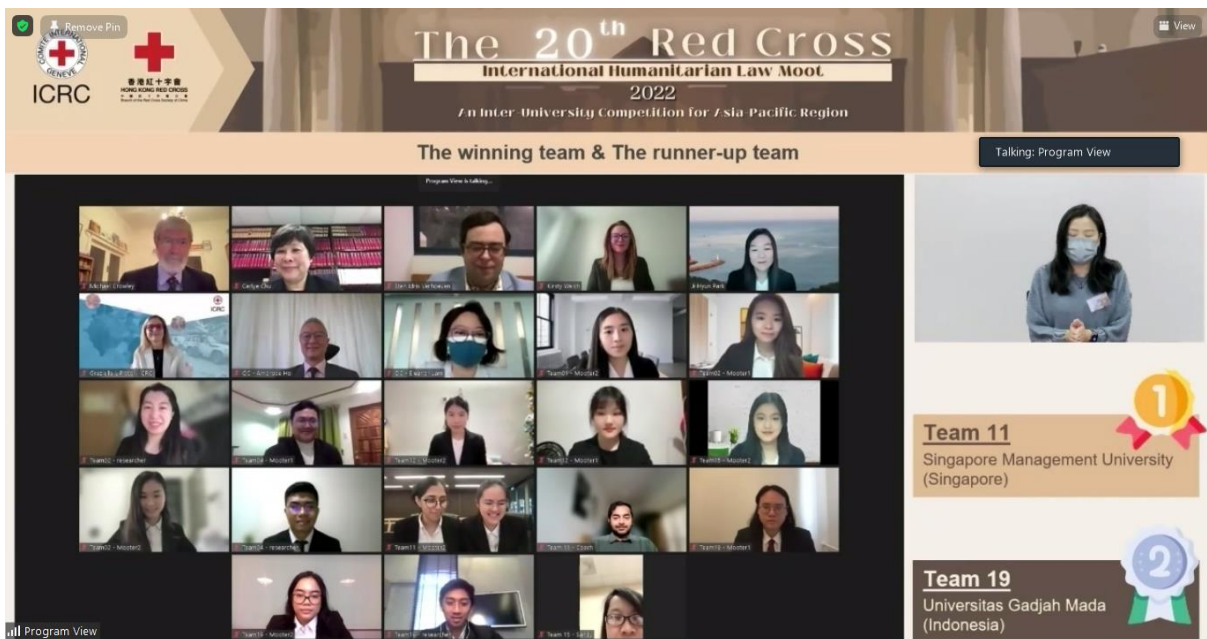
Photo 1: The final round and prize presentation ceremony was broadcast online. We got together, transcending time zone and geographical restrictions, to promote the importance of international humanitarian law through the competition.