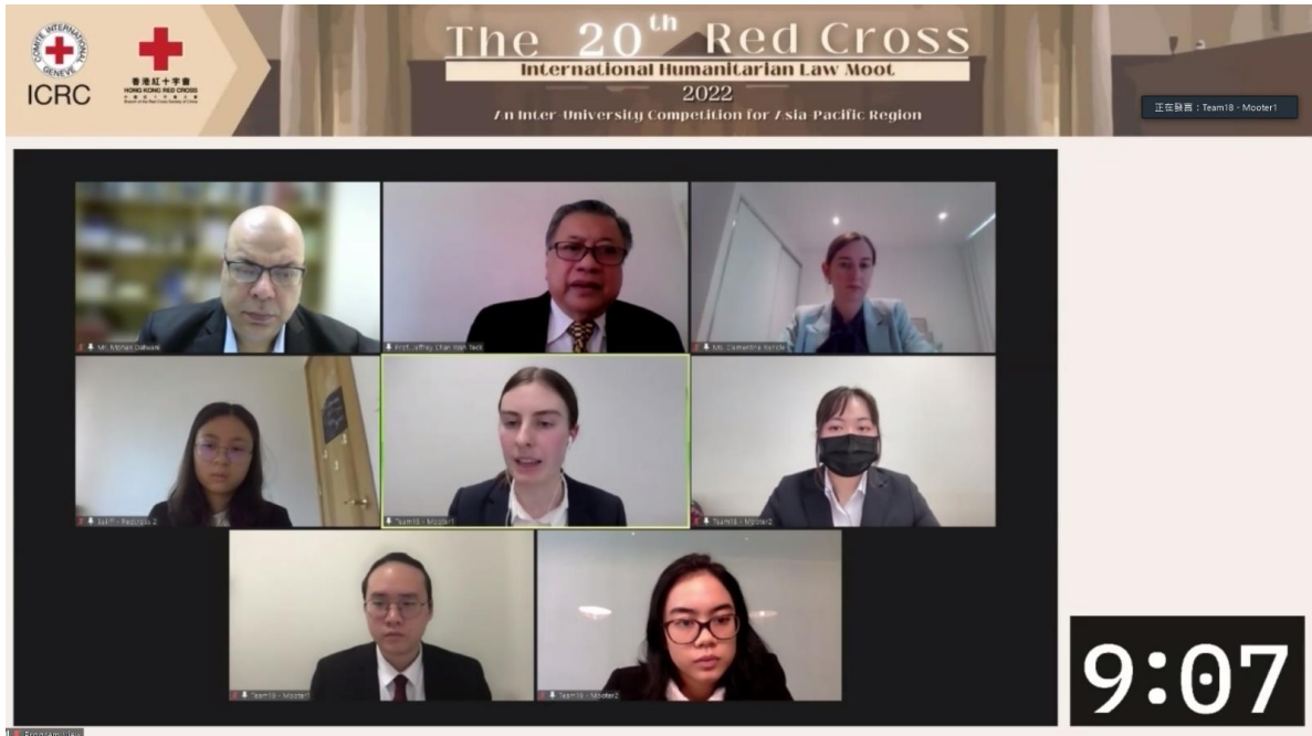
Photo 3: Though conducted online, the keen competition between the prosecutor and the defendant in the oral hearing remained.